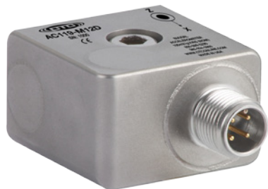
Actual Product Size Shown